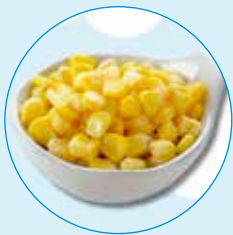
1/2 cup of sweet corn