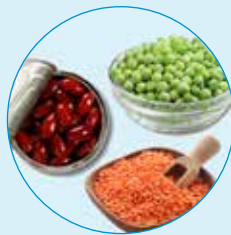
1/2 cup peas, beans or lentils