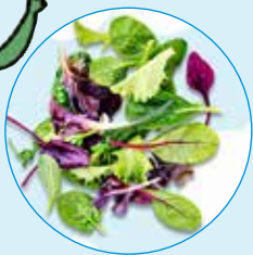
1 cup of salad leaves