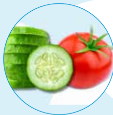
Medium tomato or 5cm cucumber