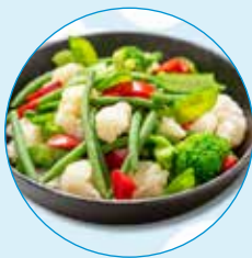
1 cup of cooked vegies